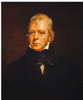
Sir Walter Scott, novelist and poet

- Scott in “Marmion, Canto VI, Stanza 17”